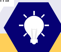
Mental Health Training