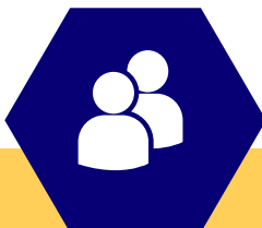
Behavior Health Point of Contact