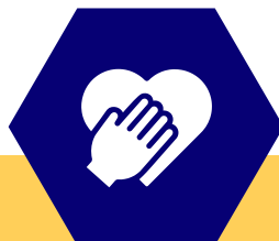
Behavioral Health Registry